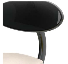
Stools with a backrest