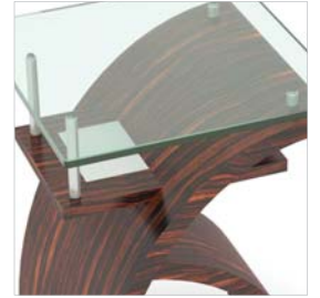
Interlocking Side Table 2