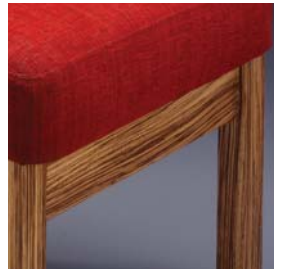
Dining Chair - material options